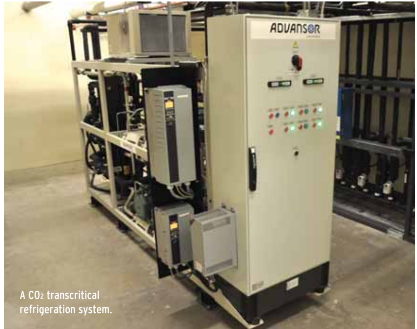
A CO 2 transcritical refrigeration system.

Voluntary measures have to date not succeeded in persuading US supermarket chains and retailers with supermarkets to begin phasing out of HFC refrigeration technologies. Instead, US supermarkets continue to use outdated and climate damaging technologies, falling farther and farther behind their worldwide competitors. Even though voluntary commitments to eliminate HFCs have been pledged through the Consumer Goods Forum, US companies have failed to take meaningful steps towards fulfilling that pledge. Regulatory action by the Obama Administration and the Environmental Protection Agency is urgently needed to require supermarkets to take prompt action to reduce their large scale HFC emissions.