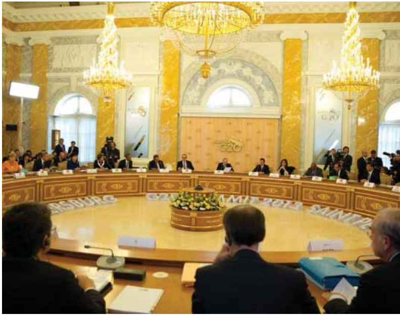
ABOVE: President Barack Obama and other world leaders agreed to use the resources of the Montreal Protocol to get rid of HFCs during the G20 Summit in Saint Petersburg, Russia, Sept. 5, 2013.

have agreed to formally discuss the amendments this year, following an agreement between Presidents Obama and Xi. 6